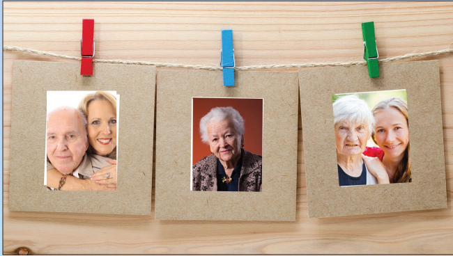
Photo Memory Wall

This year we will have a Photo Memory Wall on display. Every photo has a story behind it and we invite you to share your story with us. Please bring a small photo of your loved one to be displayed on the wall. We will collect all the photos at the end of the walk and save them to be displayed each year. If you need help printing a copy of one of your favorite photos, please let us know and we will be happy to help.